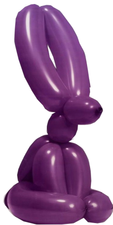
Image by Jeff Koons Almine Rech Gallery Balloon Rabbit Wall Relief (Violet) 2008